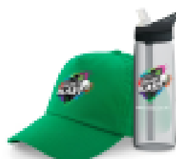
MASTER BLASTERS KIT