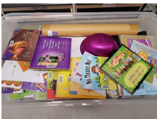
Protective Behaviours Workshop and Resources