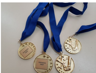
Kindergarten Sports Day Medals