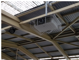
Data Projector & Sound System

Below are some of the projects/resources that they have supported financially over the last couple of years.