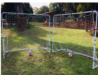
Senior Soccer Goals