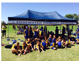
Faction Marquee Banners