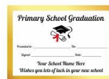
Year 6 Graduation