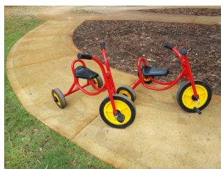
Early Childhood Trikes