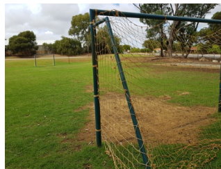
Junior Soccer Goals