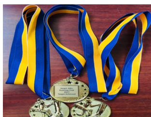
Running Club Medals